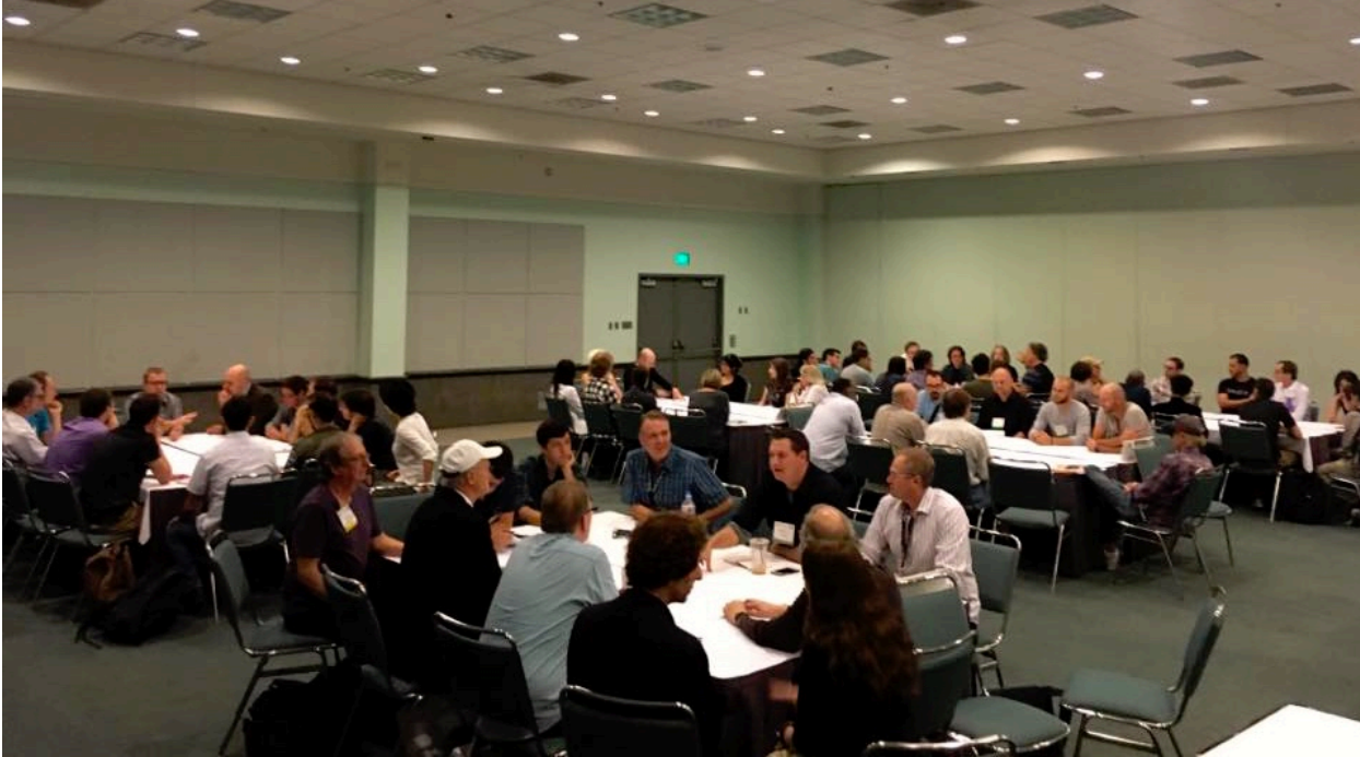
SPARS Speed Mentoring Group at AES Convention