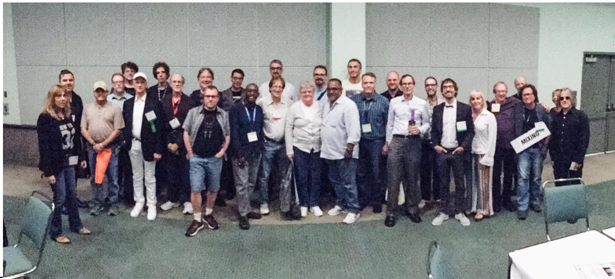
2016 SPARS Mentors